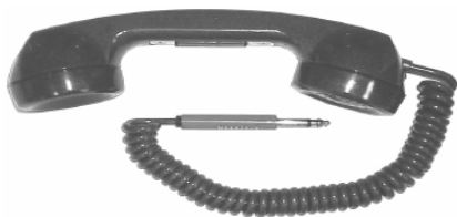
FHS Firefighter's Handset

This handset comes with a coiled cord. The attached plug fits Firefighter's Phone Jack, Model FPJ, allowing firefighters to make direct communications with a central control area.