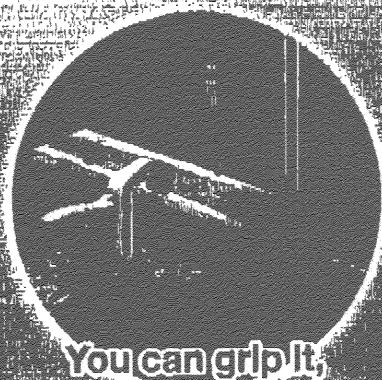
You can grip it,