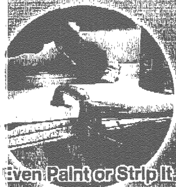
Even Paint or Strip it.

S queeze to adjust and lock. Click to release. Lightweight and portable, use it on the job, in the workshop, garden, garage even camping... What can't you do with a QUICK-GRIP® HANDI-CLAMP™?