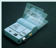
Adjustable "Flip-up" display