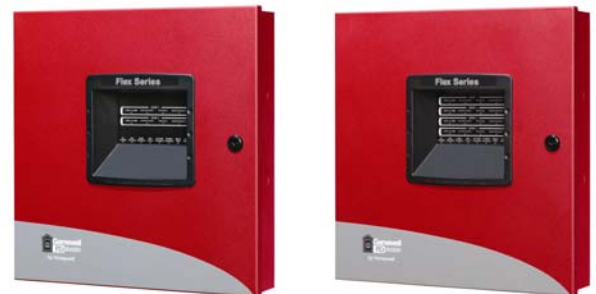
GWF402 (left) and GWF404 (right)