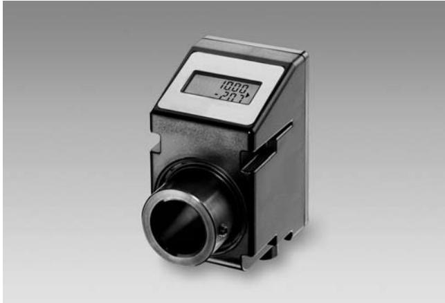
N 140 with cable output